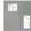
PSH300A-LVC Shown With Full Cover & Access Plate